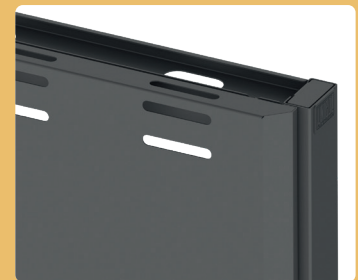
Vented rear and top sections allow for airflow to and from tiles.